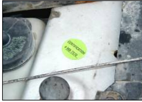
Prohibited: Air-conditioning system containing CFC