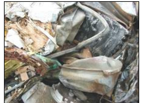
Prohibited: Un-punctured gas tank commingled with other scrap