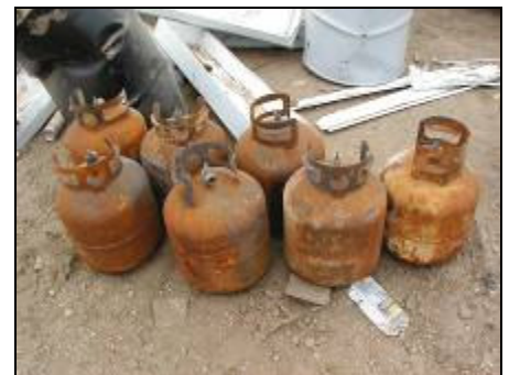
Prohibited: Propane bottles inside vehicles