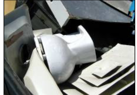
Prohibited: Non-metallic materials inside crushed vehicle