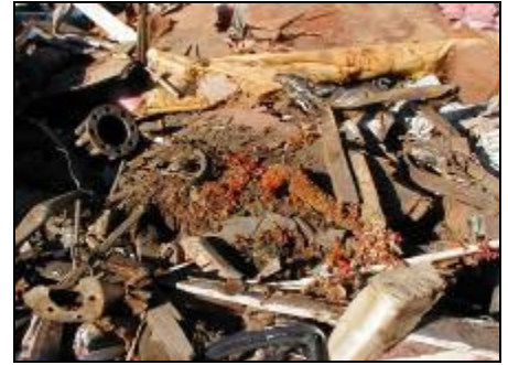
Prohibited: Non-metallic materials inside crushed vehicle