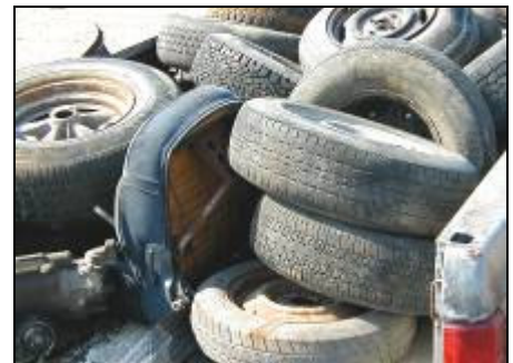
Prohibited: Excessive number of tires