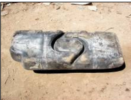
Prohibited: Un-punctured gas tank