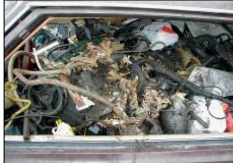
Prohibited: Non-metallic materials inside vehicle