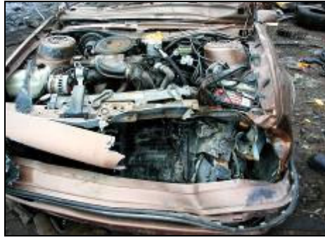
Prohibited: Lead-acid battery left in a vehicle