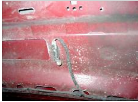
Prohibited: Mercury switch under hood