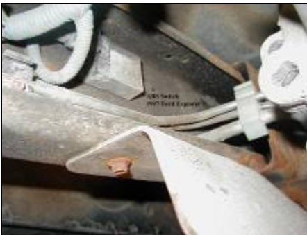
Prohibited: ABS mercury-containing switch located on the chassis on the underside of vehicle