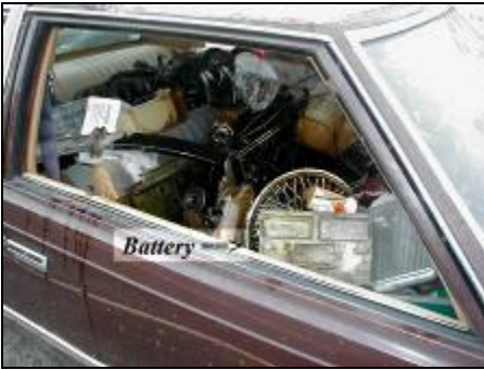
Prohibited: Lead-acid battery left in a vehicle