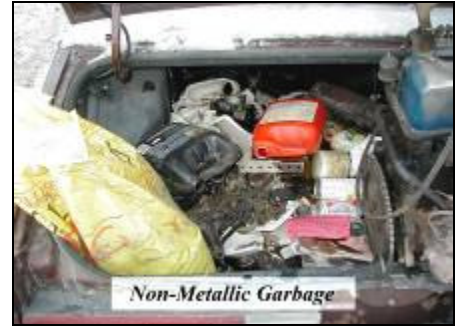
Prohibited: Non-metallic materials inside vehicle