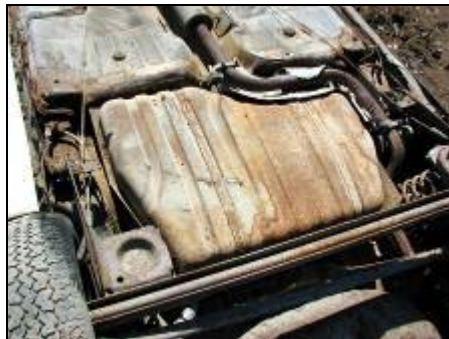
Prohibited: Un-punctured gas tank on vehicle