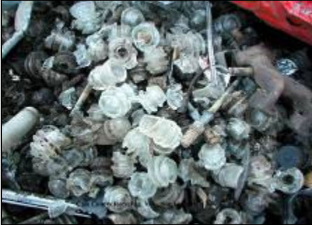
Prohibited: Non-metallic materials inside trunk of crushed vehicle