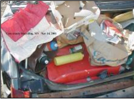
Prohibited: Propane bottles and non-metallic materials inside trunk of crushed vehicle