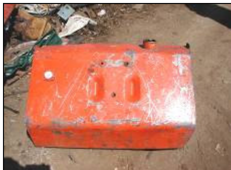
Prohibited: Un-punctured miscellaneous fuel tank