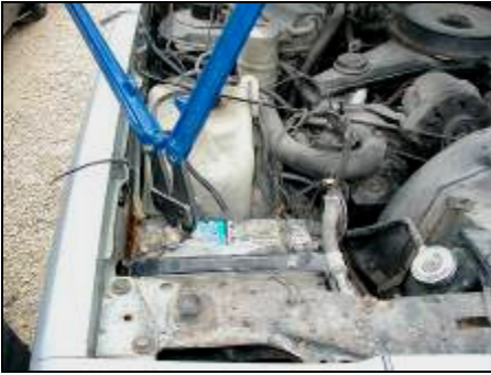
Prohibited: Lead-acid battery left in a vehicle