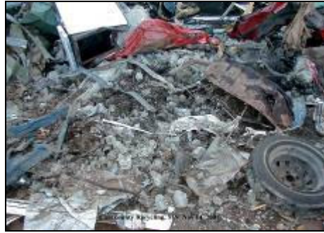
Prohibited: Non-metallic materials inside crushed vehicle