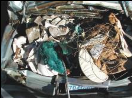
Prohibited: Non-metallic materials inside trunk of crushed vehicle