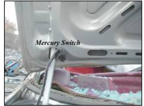
Prohibited: Mercury switch in trunk