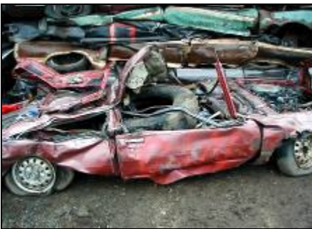
Prohibited: Extra oversized tires