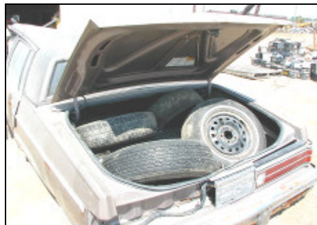
Prohibited: Excessive number of tires